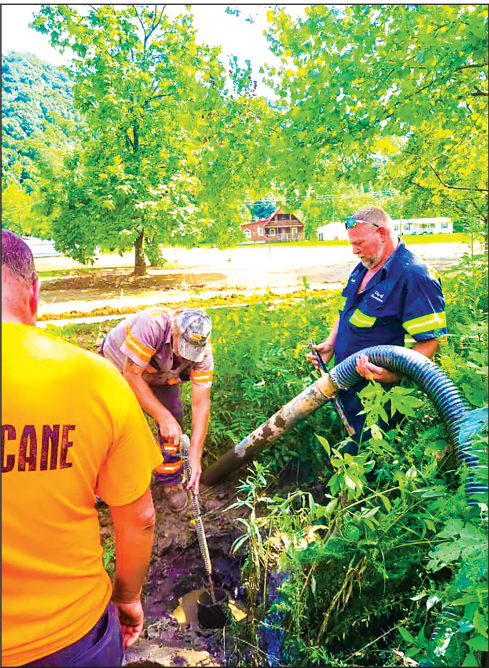
The Infrastructure Response Team repaired both water and sewer lines.