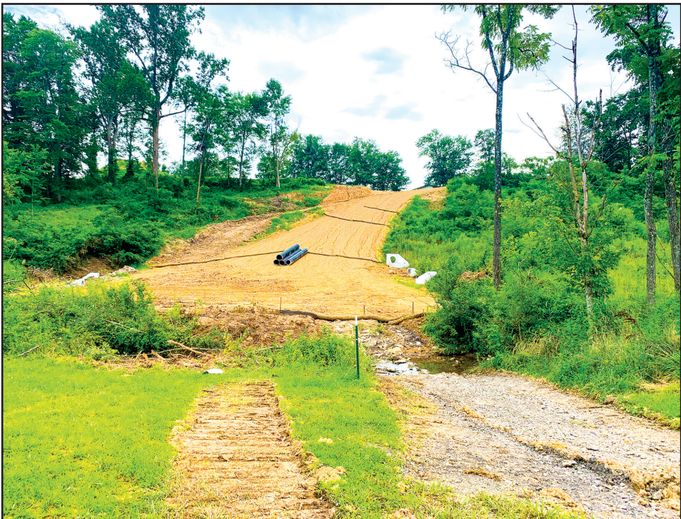
Pictured is the site of the bridge which will connect Main Street to Bridge Park.

The next regular council meeting will be Tuesday, September 6, at 6:30 p.m.