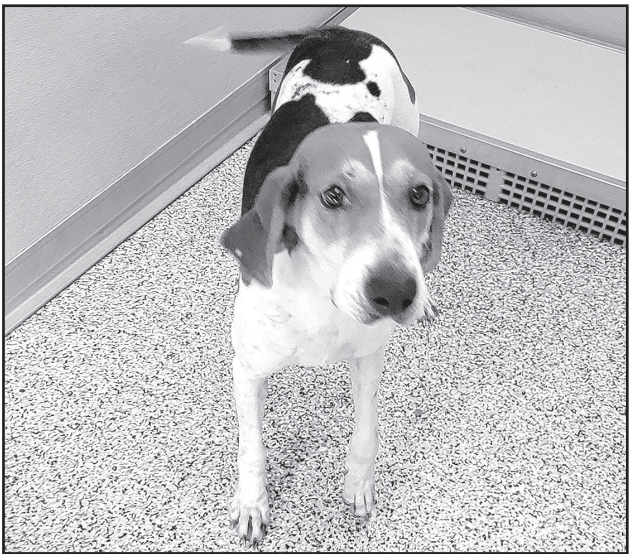
This is Dixie Id# 48623. Dixie is a 2 year old female Coonhound who came to the shelter as a stray.