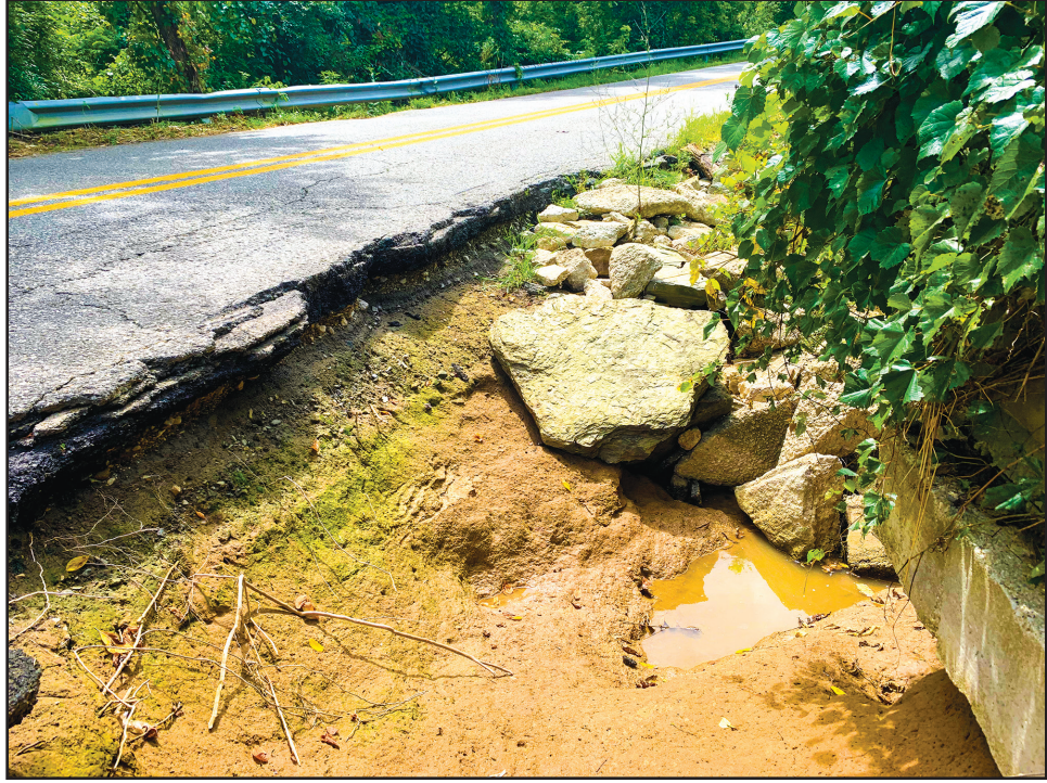
This section of Harbour Lane in Hurricane is too narrow to carry two-way traffic. The roadway washed out in May. There are no warning signs to alert motorists of the condition. The first day of school is Wednesday, August 24.