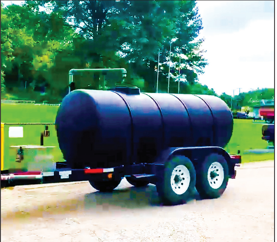
The Hurricane water buffalo transported water from Prestonsburg (56 miles distant) to Whitesburg.