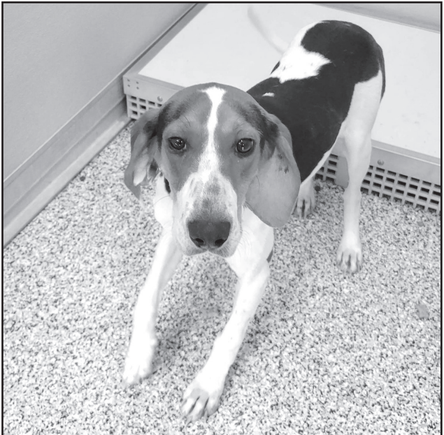
This is Rube Id# 48625. Rube is a one year old male Coonhound who came to the shelter as a stray.

For more information, call the Putnam County Animal Shelter at 304-586-0249.