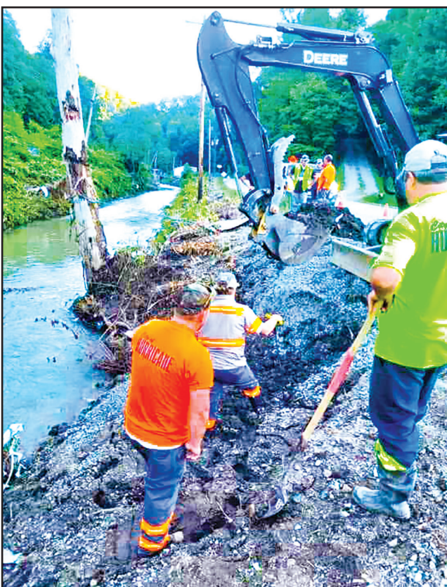
The City of Hurricane excavator was busy clearing debris and in building a road to the Whitesburg water tank.

Representatives from the Girl Scouts of Black Diamond Council, local Girl Scouts will be providing samples on Aug. 16 at 10:30 a.m. at Girl Scouts of Black Diamond Office Board Room, 321 Virginia St. W., Charleston WV 25302