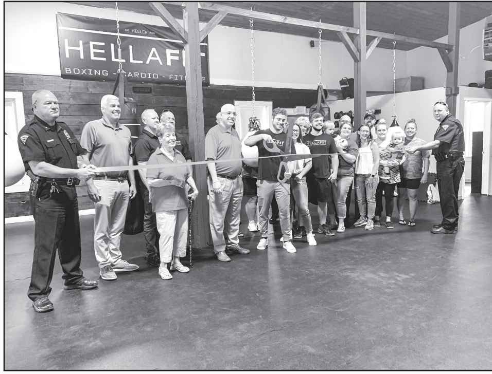
City officials and HellaFit staff prepare to cut the ribbon at the fitness center's grand opening celebration.