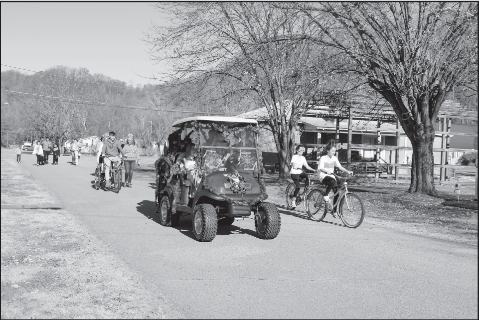
Residents rode bikes and drove golf carts in the parade.

Subscribe to the Breeze in Putnam County for Only $20.00 per Year