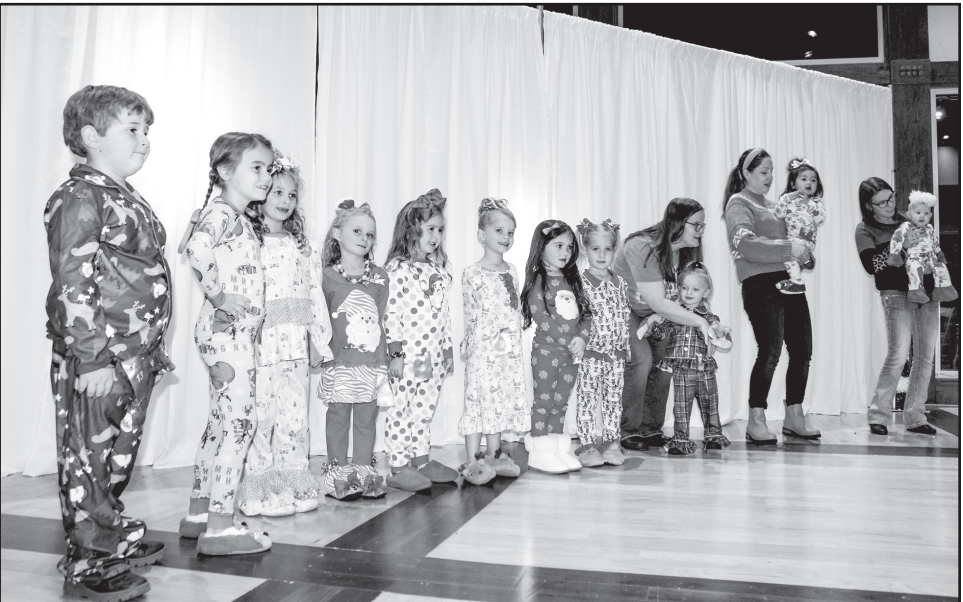
Competitors in the Yuletide Pageant line up in front of the judges.