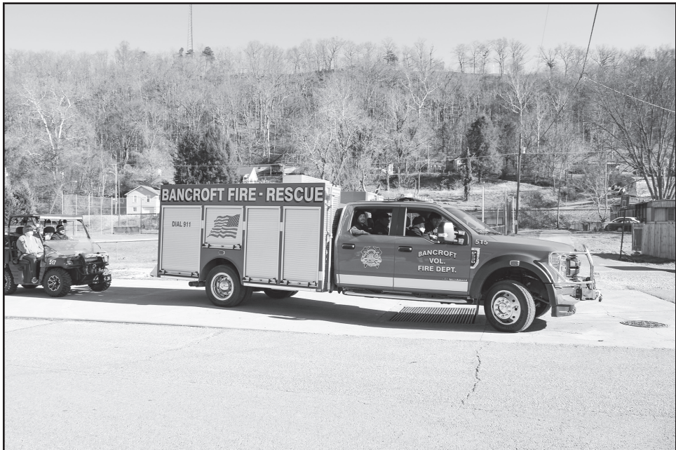
Leading the parade was a Bancroft fire truck.