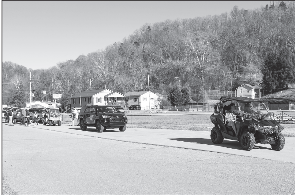
The Bancroft Thanksgiving Parade makes its way down the street.