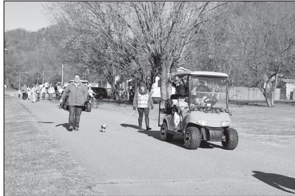
No dog is too small to walk in the parade.