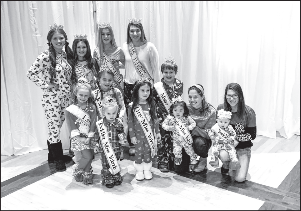
Winners of the Yuletide Pageant gather for a group photo.