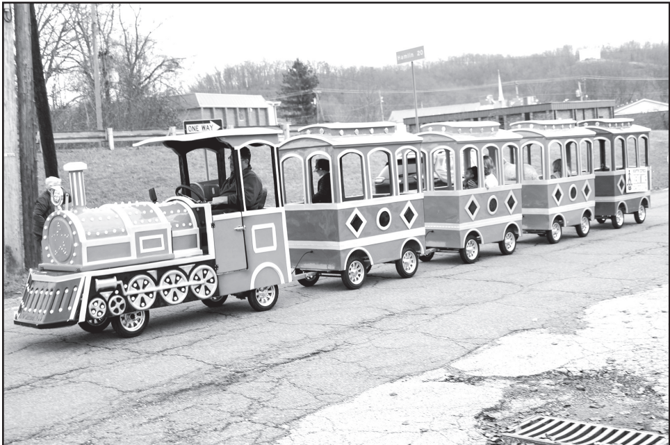
The Christmas Train chug chugged all the way from the North Pole to make its first appearance in the Hurricane parade.