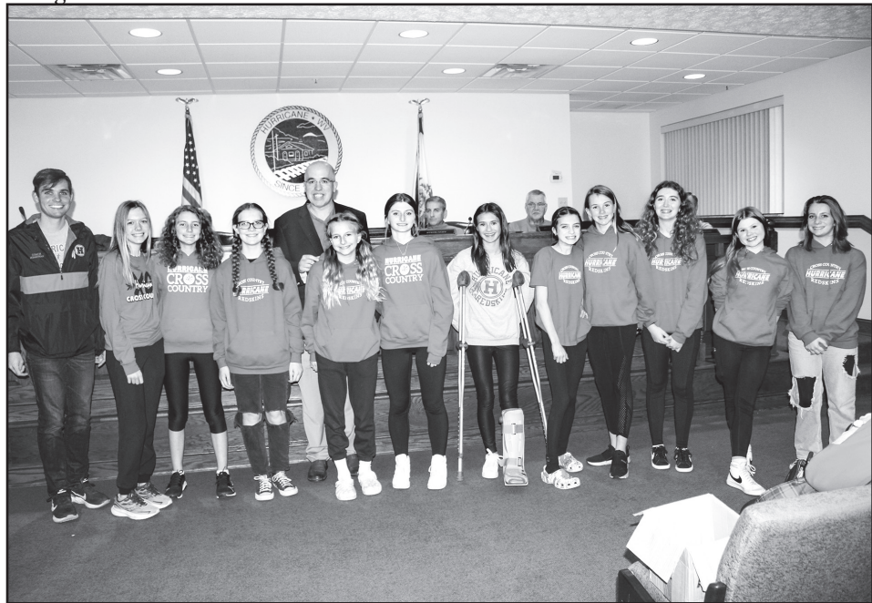
Hurricane Middle School Girls Cross Country Team