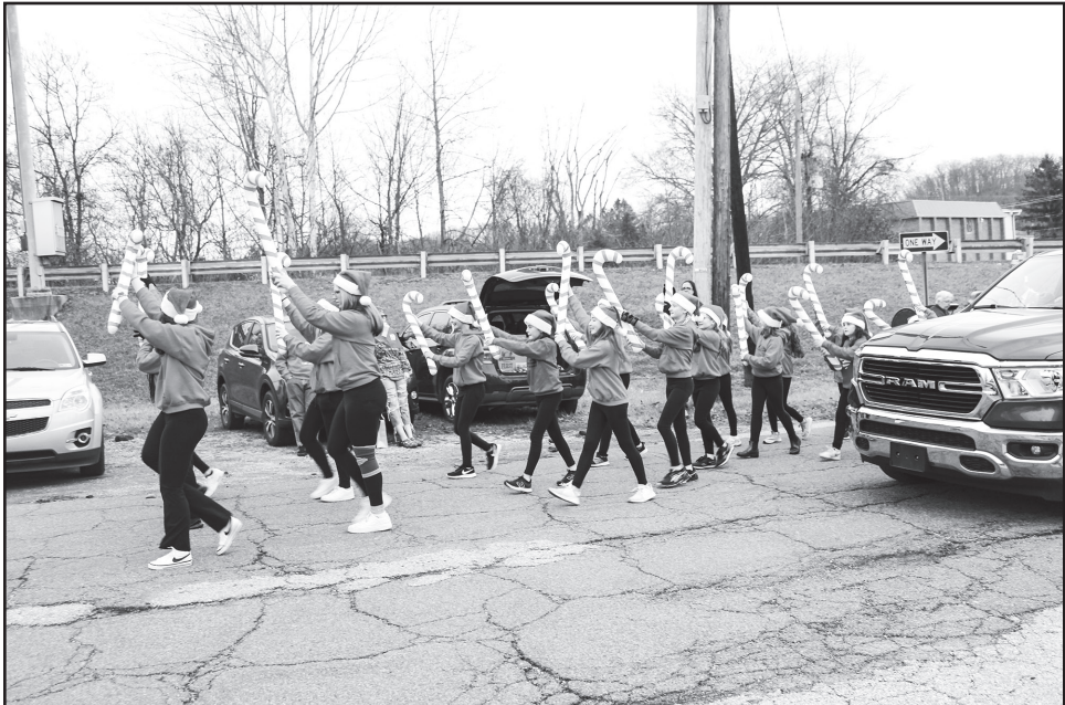
Dancing Unlimited members put on a show.