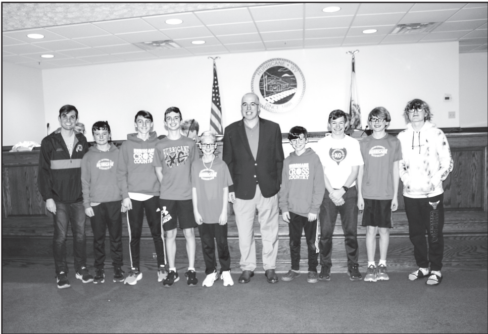
Hurricane Middle School Boys Cross Country Team