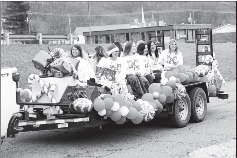
Hurricane Town Elementary staff are truly the “Candy Cane Crew!”