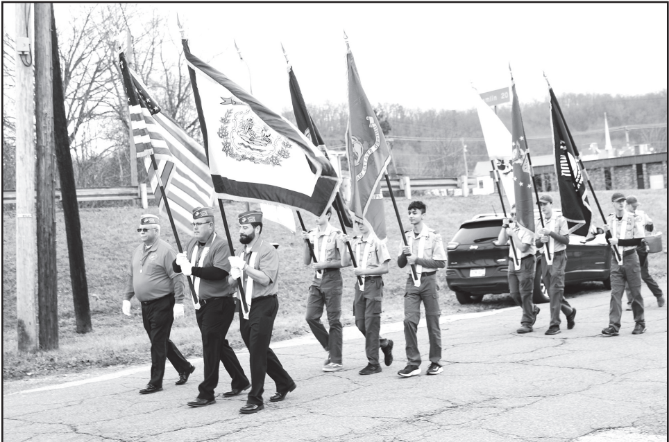
Marine Corps League Detachment #1474 is “Semper Fi” in leading Hurricane’s parades.