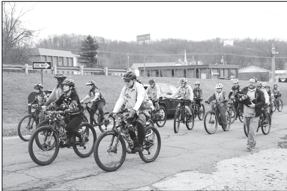
This bicycle club has become as regular as Santa at the annual parade.