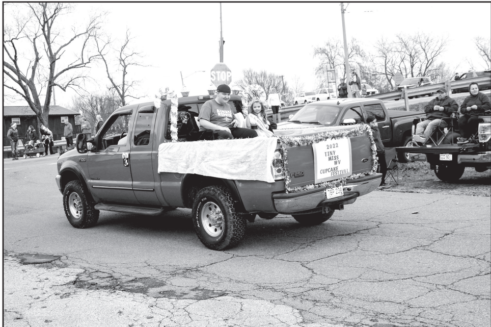
There is nothing like the thrill of riding in the parade and tossing out treats.