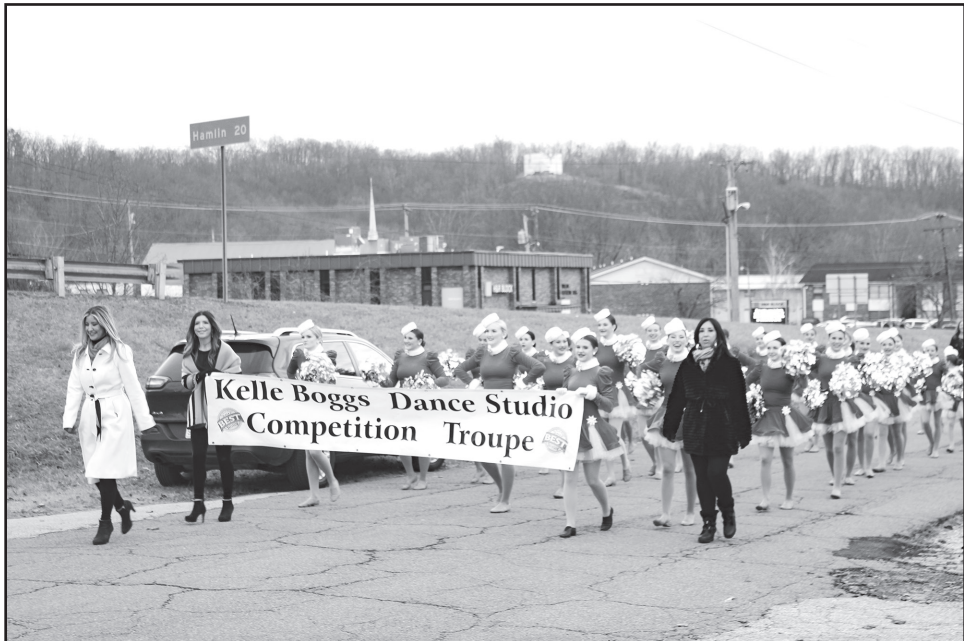
The Kelle Boggs dancers are regular participants in the Christmas parade.