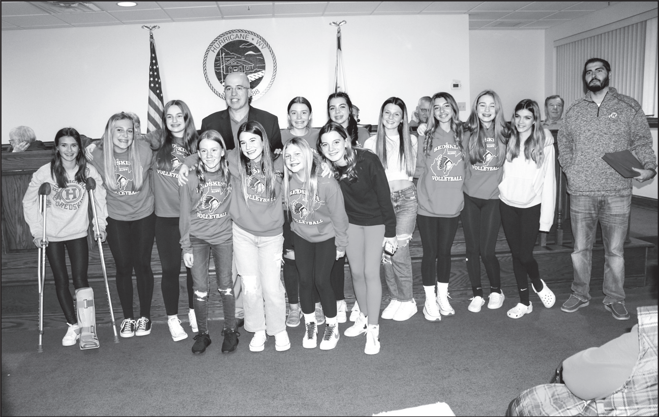
Hurricane Middle School Volleyball Team

Subscribe to the Breeze in Putnam County for Only $25.00 per year 304-562-9881