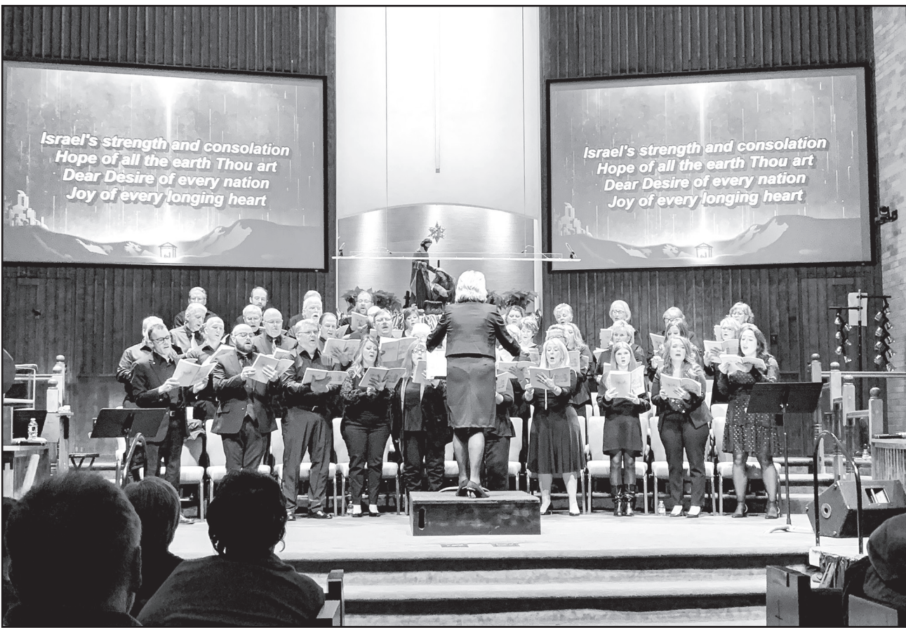
The choir of First Baptist Church performed in the cantata held last Sunday.