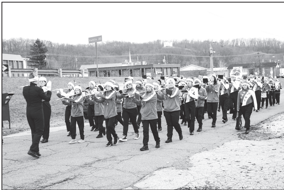
The Hurricane High School Marching Band was impressive.