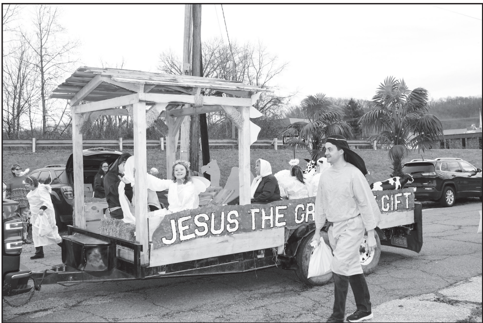
A reminder of why Christmas is.