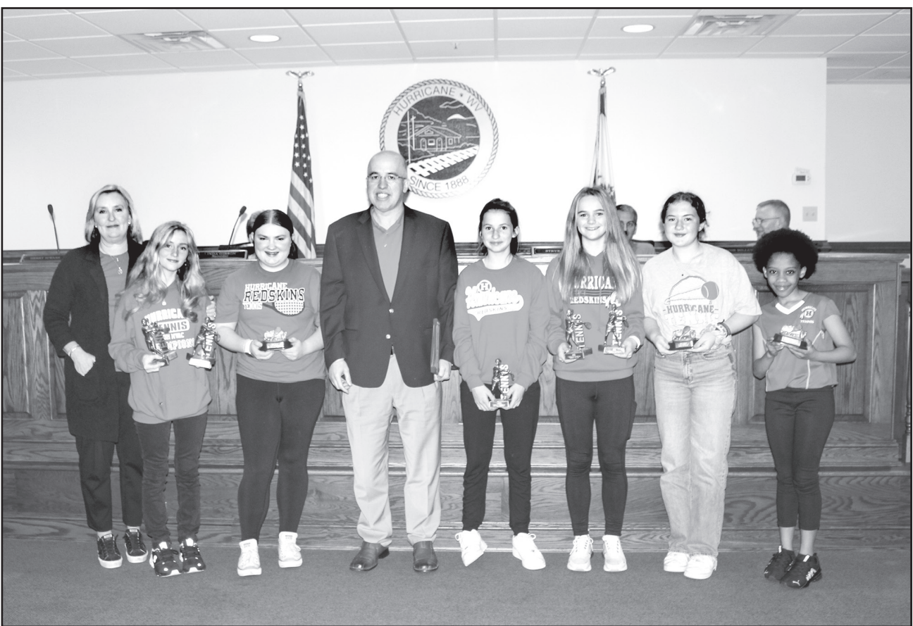
Hurricane Middle School Girls Tennis Team