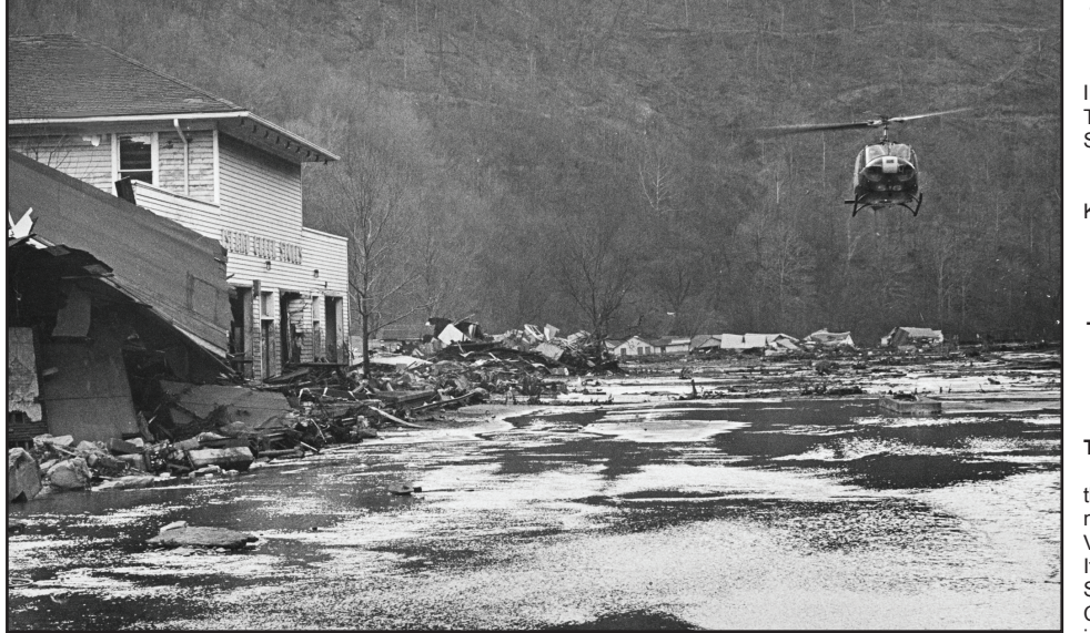
The Buffalo Creek flood killed 125 and injured one thousand individuals.

The Monroe counties. county was named after George W. Summers, one of West Virginia's founders.