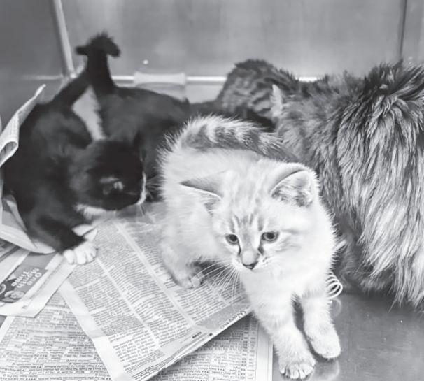
Kittens at the Putnam County Animal Shelter.

Luca is a charming and affectionate canine, who is partially timid to make new friends sometimes. He has a calm and gentle demeanor, making him an ideal companion for anyone seeking a loyal and laid-back dog. With his curious and exploratory nature, Luca would be overjoyed to roam around a farm and discover new sights and smells. He values attention and loves to be petted and cuddled, making him a delightful addition to any household/farm.